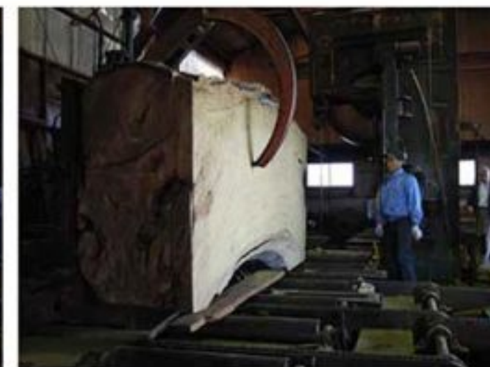
At our Okawa branch, we can process wood of even this size.

Over hundreds and thousands years, though its shape always changing, "the power of wood" has made our lives richer.