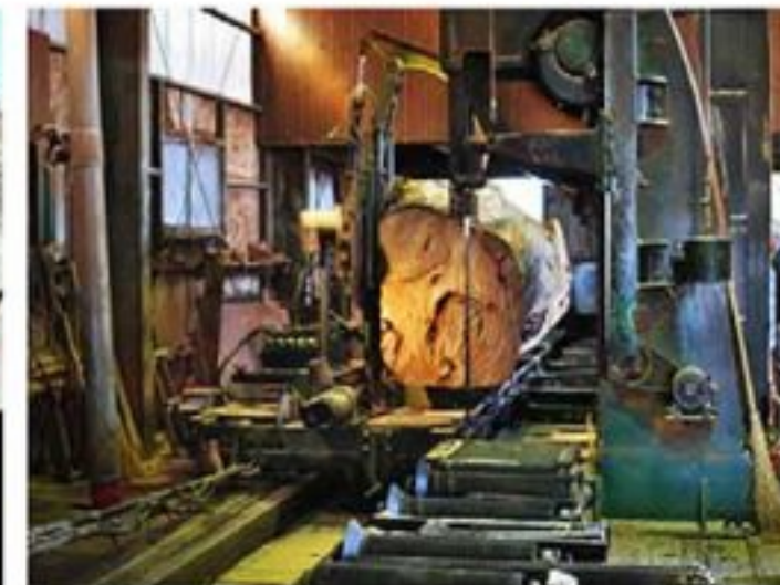
Wood like this requires a specific slicer.