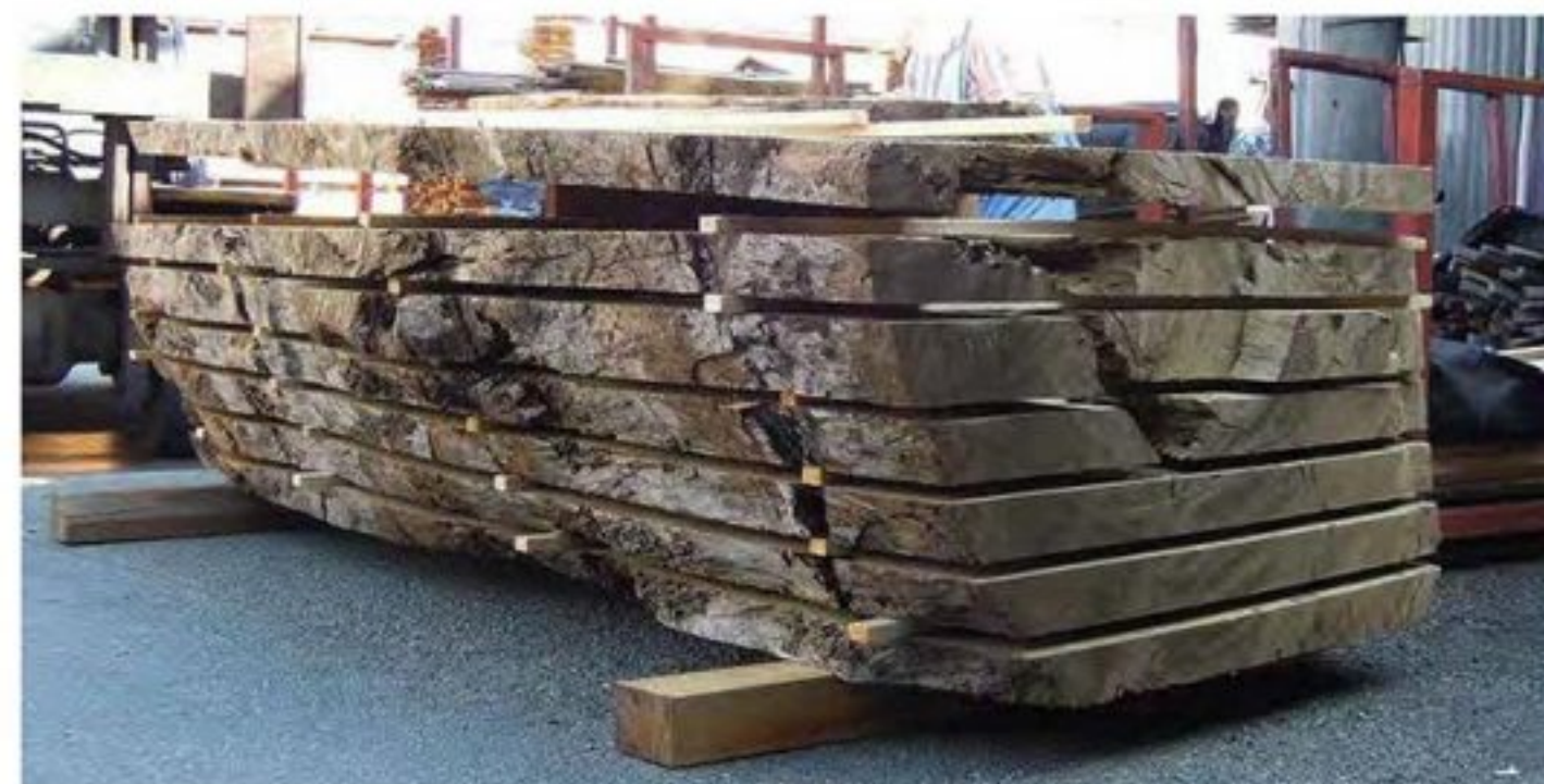
Wood sliced thick like this will be naturally dried as it is. It cures outside for long time before finally becoming a product.

This gives our minds ease, calm, and comfort.